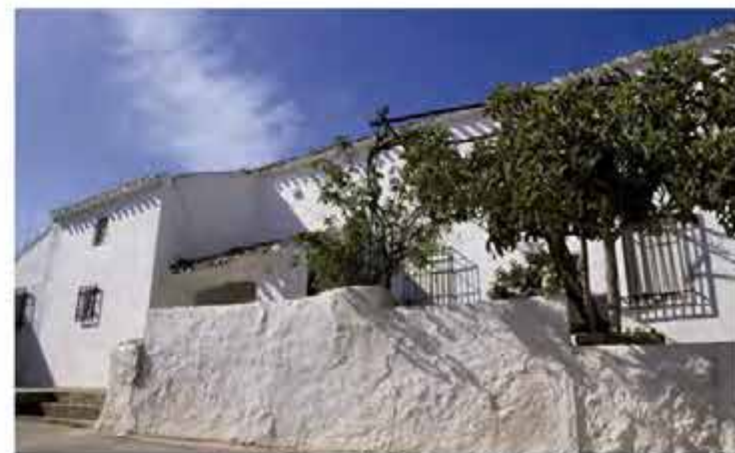
Traditional architecture of El Poleo