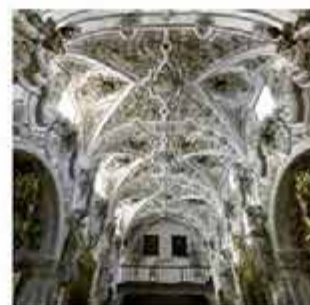
Church of Aurora