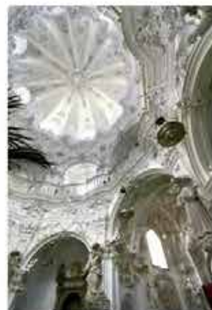
Church of Asunción

Seven museums can be found in the towns of Priego de Córdoba. The " Museo-Casa Natal ", a museum and birthplace of a former President of the Second Republic, the Niceto Alcalá Zamora y Torres ; the Archaeological Museum where important artefacts from the town's past are displayed; the Antonio Povedano Center of Modern Spanish Landscape Art ; the Ethnographic Museum of Castil de Campos , the Museum of the Almond in Zamoranos , and the Mycological Garden .