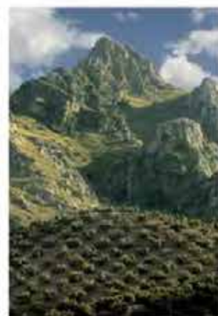
Peak of Tiñosa

The Mycological Garden is part of the Network of Botanical Gardens of Andalucía. Its uniqueness, its value to the conservation of fungus species and its mission to educate and involve the general public—all combine to form a special contribution to the sustainability of the area, and offer a high quality tourist attraction for nature lovers.