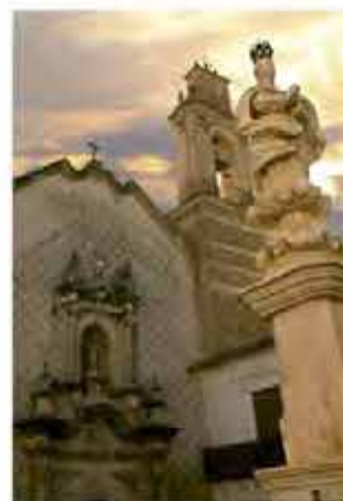
Church of San Francisco