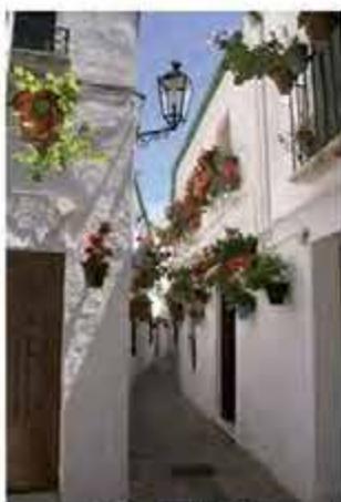
Barrio de la Villa